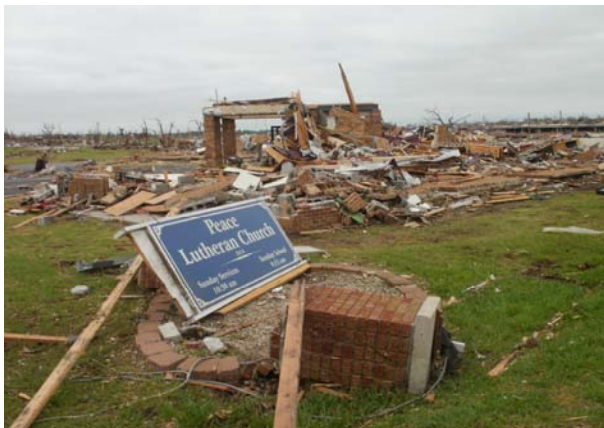
Tornado damage done to Peace Lutheran Church, Joplin, MO on May 22, 2011, destroyed the entire building.